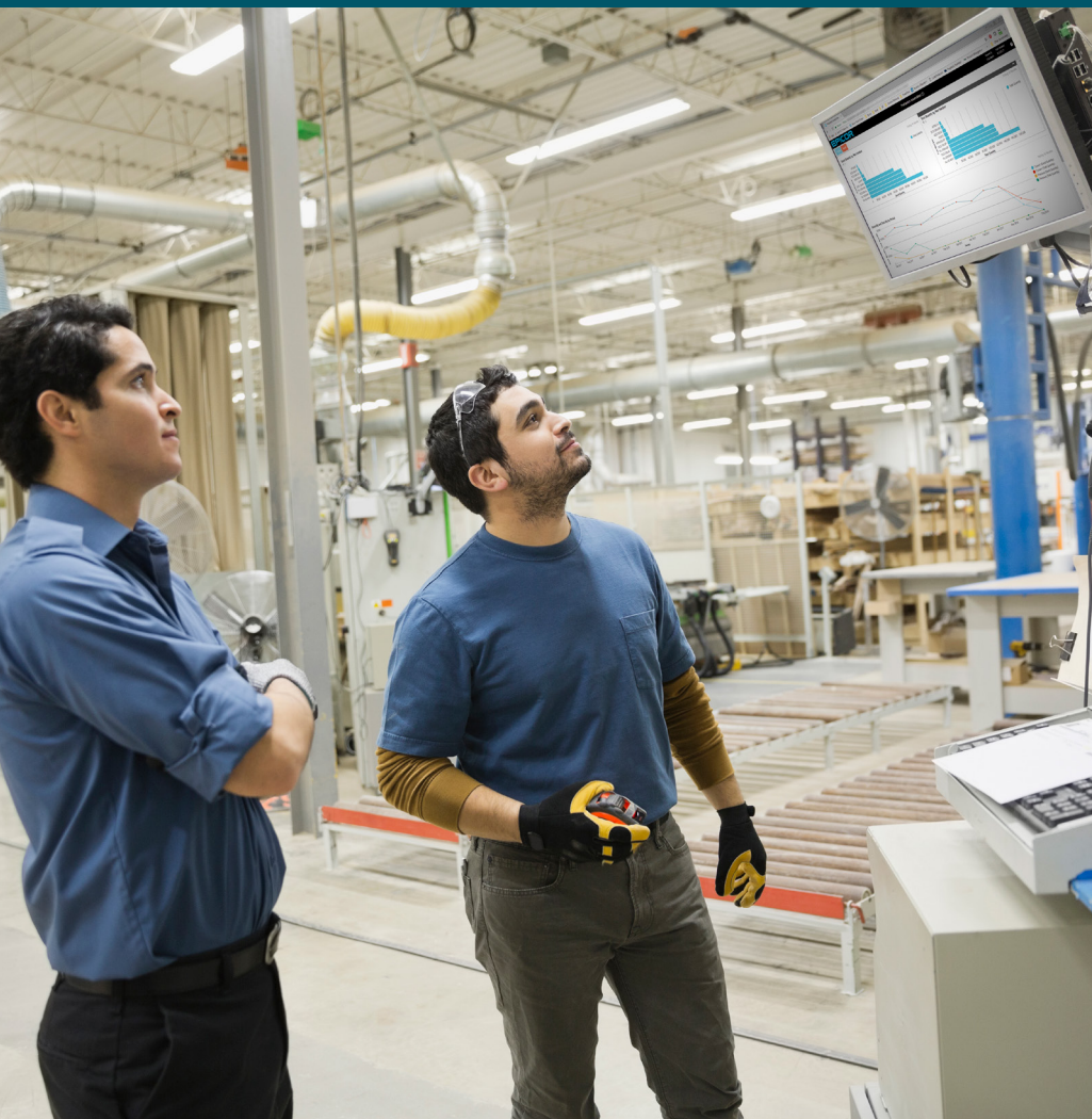
Public Internal Dashboards production floor use example