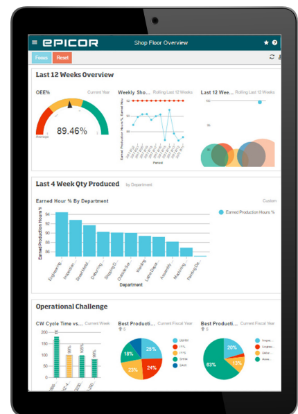
Dashboard on a tablet

Public Internal Dashboards feature provides a live display link